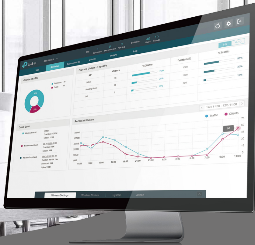
Omada Software Controller

EAP115/EAP110/EAP110-Outdoor/EAP115-Wall/EAP225-Wall